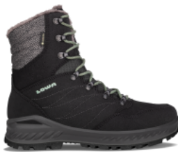
Black/jade 420559 9910