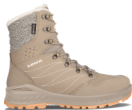
Sand/beige 420559 4311